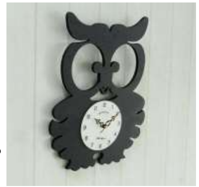
Design and Build your own clock